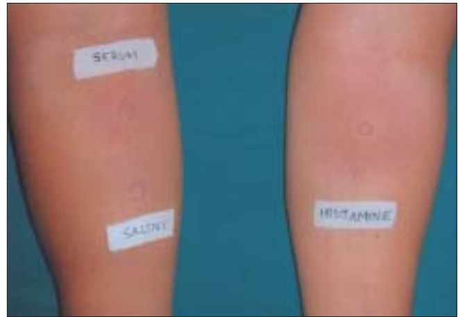
Figure 1: Positive response to ASST - intradermal injection of autologous serum has provoked a weal of 7 mm diameter

Patients were categorized into two groups (ASST-positive and -negative) based on ASST, for evaluation of clinical features.