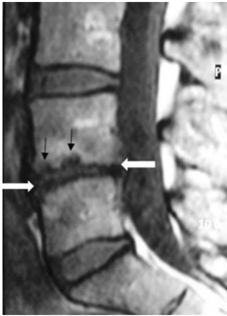
Fig. 1 T1-weighted MR image of a lumbar spine with one degenerated disc after 1-year follow-up. Disc space L4/L5 has decreased disc height and Schmorl lesion-type defects ( thin arrows ) and irregularities ( white arrows ) at the endplate region (border between disc and subchondral bone marrow). Modic 2-type abnormal (hyperintense) signal change in the subchondral bone marrow surrounds bony irregularities and endplate defects adjacent to both the upper and lower endplates of the L4/L5 disc