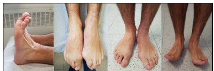
Fig 3: At physical examination, there was normal and symmetric range of motion in dorsiflexion and plantarflexion. There was no swelling, no tenderness or pain and no scar-related complains. The patient was capable of toes and heel walk at 4 months follow-up.