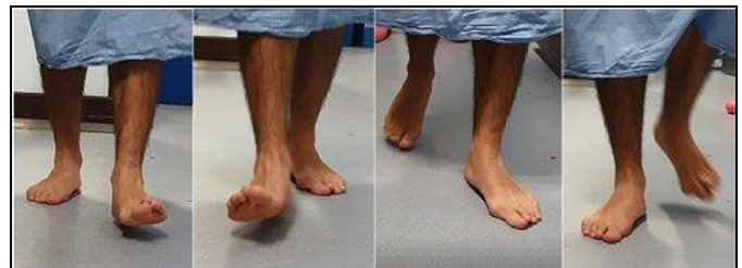
Fig 1: Gait analysis. Terminal swing phase shows a diminished left ankle dorsiflexion and inversion of the foot, no activity of anterior tibial tendon is seen in comparison with contralateral. Midstance phase shows a slightly plantar arch collapse of the left foot.

No postoperative complications occurred.