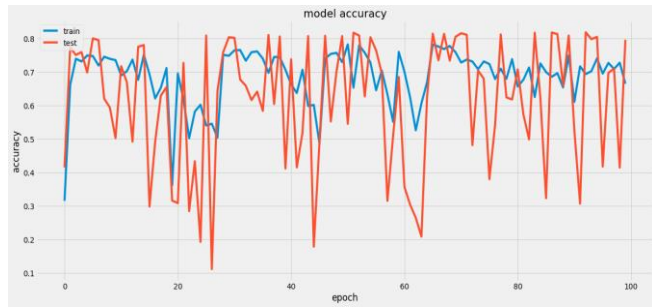
Fig.6. Visualizing CNN model val_acc and accuracy.