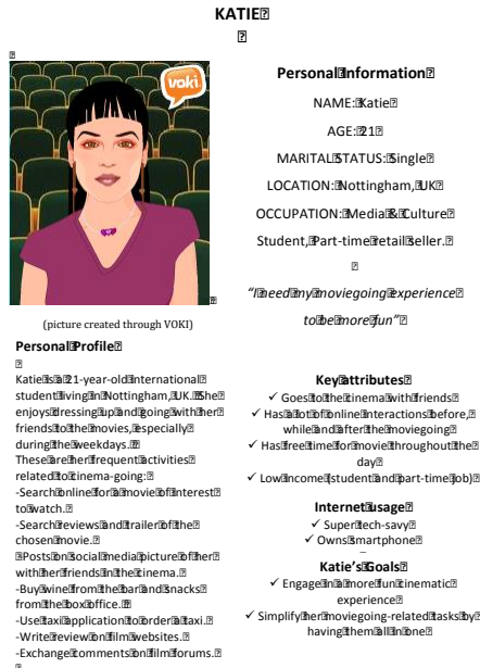
Figure 1: Persona No1.

the guidelines from (Braz, 2005; Crothers, 2011). This set of data segmented the cinema audiences into categories and involved specific practices, which informed our design. A printed copy of each persona was handed out to each participant and included: Printed photo of the persona; Name; Personal information; Personal profile with the key activities related to cinema-going; Key attributes; Internet usage; Persona's goals.