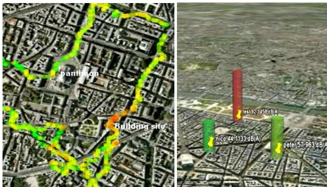
Figure 4. Visualisation with Google Earth. On the left, the collective noise map generated by all the measures. On the right, a real time visualization of the collective noise exposure experience of the participants

collective noise map is also publicly available. This map is constructed by aggregating all the shared measurement by the participants. Each map can show a layer of tags entered by participants to add context and meaning to the loudness data. A real time monitoring of the loudness readings of all participants is also available.