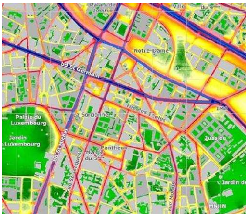
Figure 1. Official noise map of Paris generated using a computational model and measurements made at a limited number of locations and times. Quiet areas are coloured in green while noisy places are in purple. Gray areas represent places for which no information is available (e.g. in buildings).

Indoor noise assessment: current noise mapping only covers environmental noise, i.e. outdoor noise. However, most people spend a significant portion of their time indoors and such indoor exposure is reported in the maps (Fig.1: area in gray with no information).