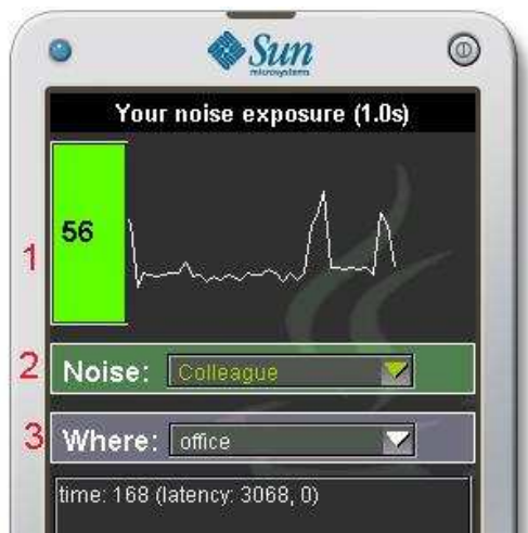
Figure 2. The Mobile sensing application. Including 3 components: (1) The visualization of the loudness measured and a color representing the danger (2) The noise tagging (3) The tagging of the location (for indoor location for instance)

The current prototype on the NoiseTube platform consists of an application which the participants must install on their mobile phone to turn it into a sensor device. The mobile sensing application runs on GPS-equipped mobile phones. This application collects local information from different sensors (noise level, GPS coordinates, time, user input) and sent them to the NoiseTube server. The server centralises and processes the data sent by the phones.