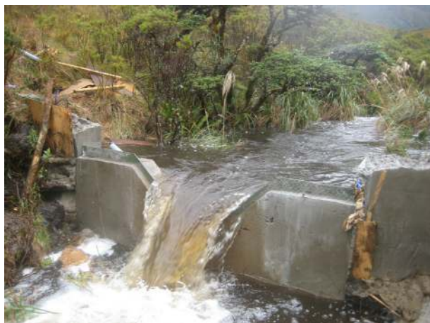
FIGURE 2 | V-notch weir for river flow measurements installed as part of the iMHEA monitoring network in the Peruvian Andes.

A main problem is the disconnect between the governmental or donor recommended practices and what farmers are willing to maintain voluntarily without governmental interventions. For instance, government agencies recommend the installation of 60 cm deep and 30–40 cm wide swales on the contour to intercept excess rainfall and to allow it infiltrate into the subsoil. In contrast, the indigenous soil conservation practice is to plow small 10–15 cm furrows just off the contour to transport the excess rainfall,