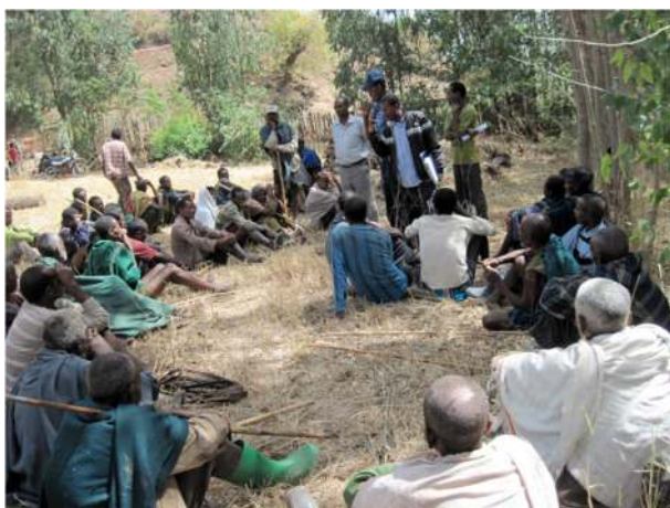
FIGURE 3 | Discussing ecosystem degradation resulting from farmers whose land surrounding the rehabilitated gully being unwilling to share the grass in the Tana Lake Region, Ethiopia.

Traditionally, water resources were exclusively used for irrigating croplands (through canals) and managed by cooperative management practices among local communities (Messerschmidt, 1986). More recently, there are competing demands from domestic use, hydropower generation and cultural significance (National Trust for Nature Conservation, 2008). Furthermore, there is an increasing water stress due to changes in snowfall and rainfall. The available water resource became highly contested resource among individuals, communities and social groups (National Trust for Nature Conservation, 2008). To adapt