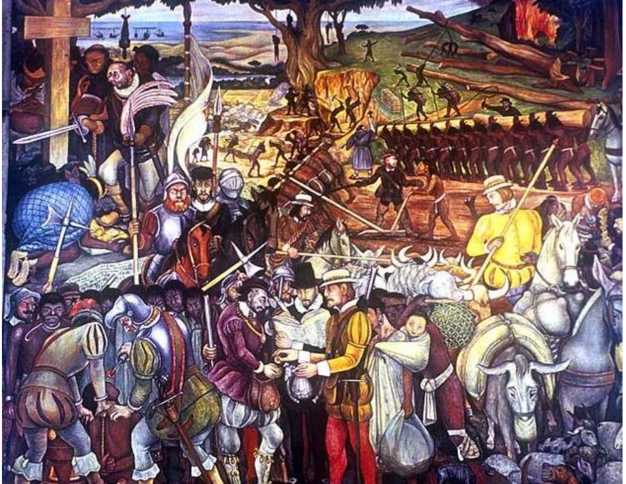
Illustration 2. Disembarkation of the Spanish in Veracruz (Diego Rivera, 1951)

During Lesson 10, students were prompted to examine Diego Rivera's Disembarkation of the Spanish in Veracruz (Illustration 2). A majority of students verbally contributed to the discussion about this image, and many of them got out of their seats, walked to the front of the room, and pointed out their various observations about this mural. During this discussion, students shared observations as well as reinterpretations as the conversation unfolded. For example, David pointed out "they are building things in the back." Olive extended this observation with "the guys in front are selling the stuff being made." And David added "but the guys in back aren't getting any of the money." Both David and Olive were interpreting symbols, like the bag held by the man in the foreground as evidence of trade. Additionally, they explored the relationships among the various figures included in the mural. Each identified the human figures in the foreground that had lighter skin to be "in charge" or more powerful than the workers David pointed out who were in the background and had darker skin.