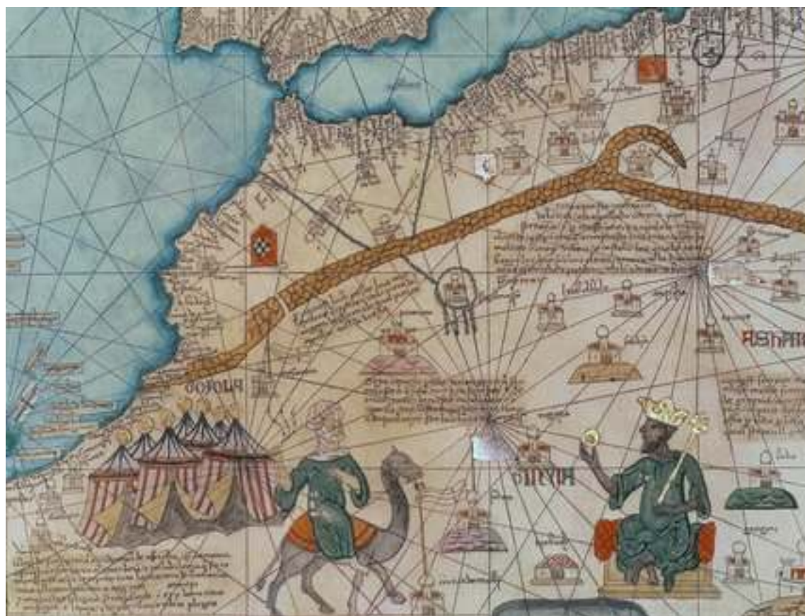
Illustration 1. The Catalan Atlas , 1375