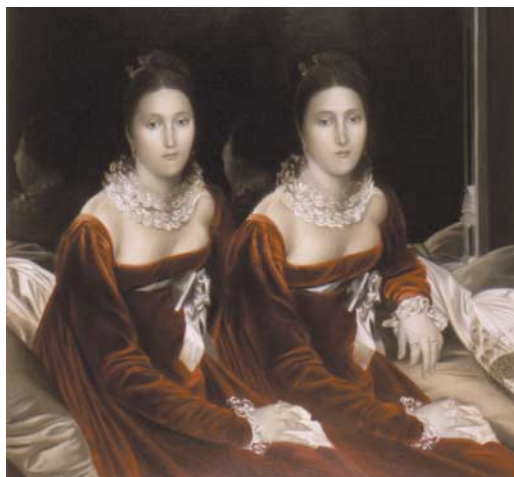
Figure 1 | Velvet twins. Oil painting on linen (145 cm × 135 cm) by Mary Waters (1997/1998). From a private collection, courtesy of Flatland Off the Record (publishers), Utrecht, The Netherlands.

CONCORDANCE The occurrence of the same trait in both members of a pair of twins. Concordance might occur for diseases as well as for behaviours, such as smoking.