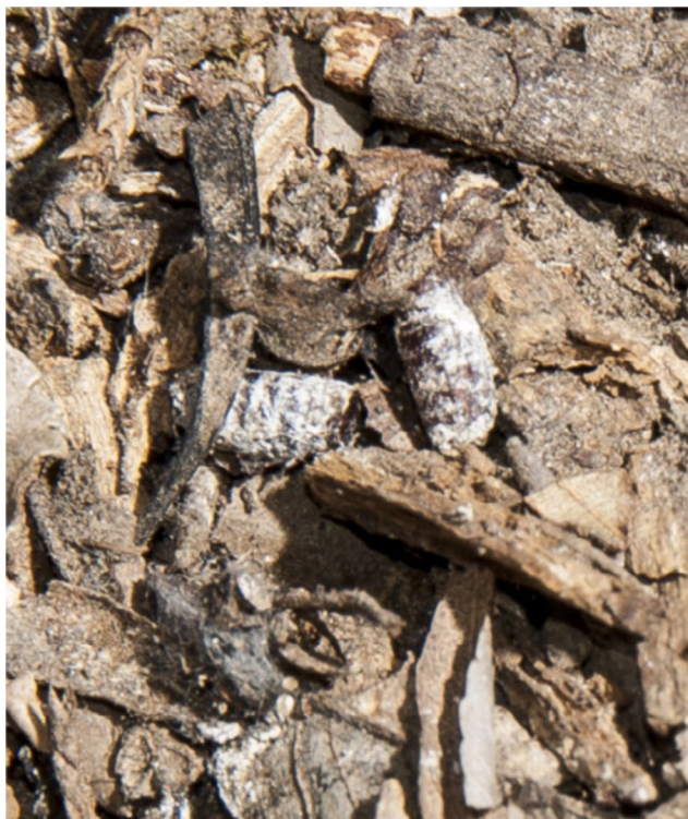
Fig. 1. Two puparia covered in adipocere, in situ, away from remains of a homicide victim.

to our laboratories for analysis. Additionally, a desiccated human tissue and bone sample with embedded puparia was provided for removal of insect evidence and osteological analysis. Various entomological samples were recovered from the soil and leaf litter material, including many puparia. Puparia also were recovered from the human tissue sample.