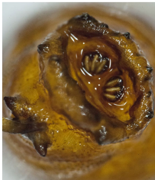
Fig. 2. The posterior of a puparium after cleaning to remove adipocere which had obscured morphological features.

The solvents we used (ethanol, acetone, and potassium hydroxide) all present potential health hazards and must be used in accordance with local regulations. In the United States, Material Data Safety Sheets provide relevant hazard data for these compounds, including appropriate protective clothing (lab coat,