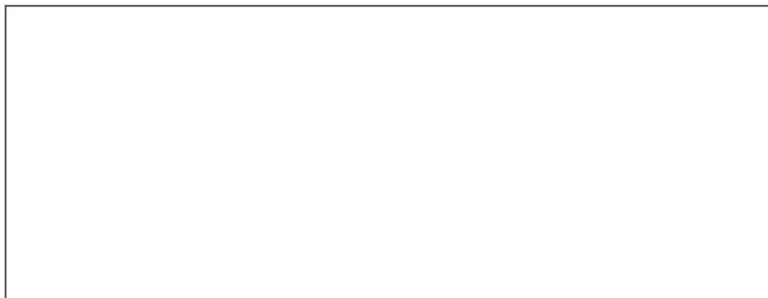
Figure 4: Concordances of 'scien*' in the context of 'so-called'

The strategy of creating associations between scientists and 'corrupt' politicians is not surprising in the context of the Daily Mail and its long history of exposing political scandals, dating back to eighteenth century campaign against 'Old Corruption' (Hollis 1970). Conboy (2008), for example, notes that in UK tabloids politicians are represented almost exclusively as involved in a game of duping the public, while implying that the tabloids themselves are doing their best to rectify the situation. As our comparative analysis of keywords has shown, associations between science and fraud, and scientists and politicians, were present in earlier comments before 'climategate', and were also observed in other studies of social media (Nerlich and Koteyko 2009). However, the topics and discursive strategies employed by tabloid readers in the 2010 corpus indicate that the East Anglia controversy might have allowed the commentators to become more assured in their assertions about this link; and to speak as if they now had proof for their views that the science of climate change was indeed 'just a money-making scam'. In other words, the controversy became a rhetorical stepping stone that allowed those tabloid readers who are opposed to the idea of man-made global warming to launch more provocatively phrased comments on the issue.