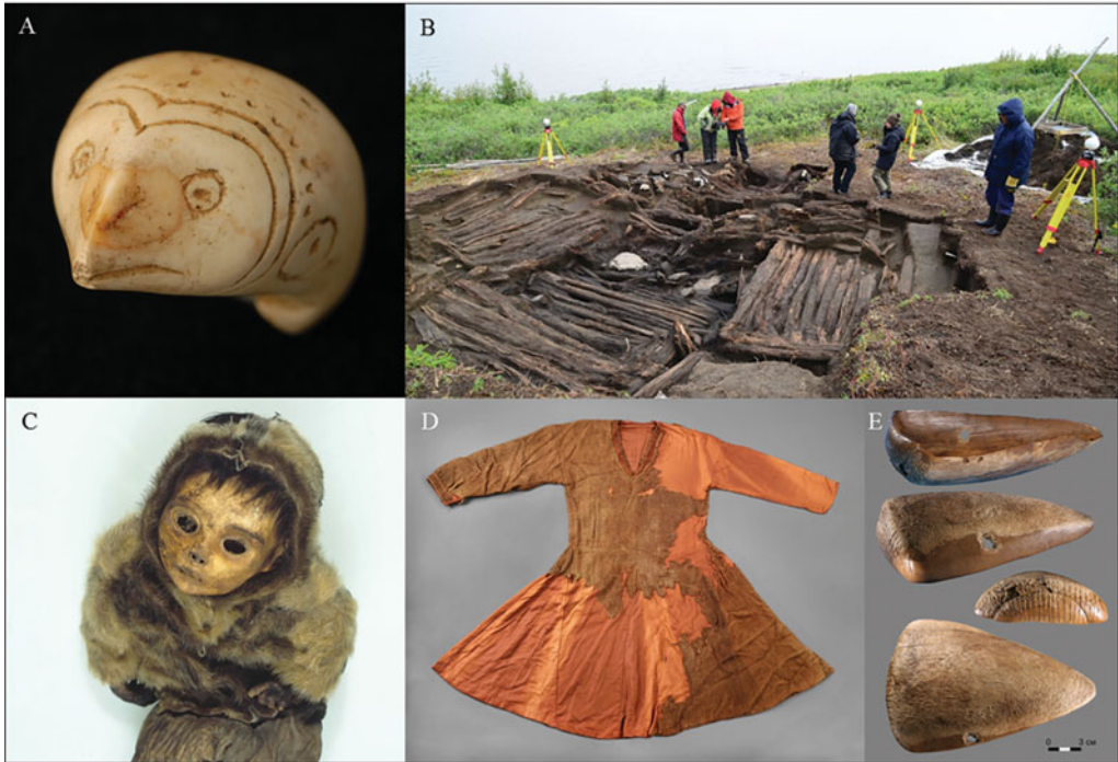
Figure 2. Examples of some of the extraordinary archaeological finds from the Arctic: A) ivory owl effigy toggle from Nuvuk, Alaska; B) pre-contact driftwood house floor from Kuukpak in the Mackenzie Delta, Canada; C) human remains from Qilakitsoq, Greenland; D) preserved medieval textiles from Andøy, Nordland, Norway; E) 31 000-year-old decorated ivory scoop from the Yana site, Arctic Siberia.