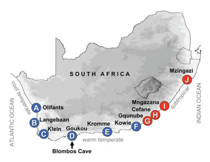
Figure 1. Sampling localities. Sampling localities (A–J) from which specimens of Nassarius kraussianus were collected. The sample sizes were: A=350, B=104, C=132, D=112, E=47, F=183, G=83, H=54, I=71, J=94. Blue circles indicate localities dominated by haplotypes present in the western range of the species' distribution, and red circles indicate sites where haplotypes of the eastern lineage were mostly found. The location of Blombos Cave (where N. kraussianus fossils were found that were worn as beads by human beings during the Middle and Late Stone Age) is indicated. doi:10.1371/journal.pone.0000614.g001

provinces, but each province has its own combination of species [8-10]. Genetic data show that some coastal invertebrates with planktonic larvae or direct development that occur in more than one province comprise two or more genetically distinct regional lineages, with boundaries that coincide with those between the biogeographic provinces [11-17]. Given the wide distribution range of N. kraussianus and the fact that it disperses by means of planktonic larvae [18], it is possible that this species may comprise several regional phylogeographic units that differ in shell size, e.g. a largebodied lineage adapted to cooler water temperature and a smallbodied lineage present in warmer water. Their distributions may have shifted as a result of climate change, with the small-bodied lineage having replaced the large-bodied lineage on the south coast. Alternatively, the larger lineage may have become extinct (e.g. during the last glacial maximum ~15-25 000 years ago) and been replaced by the smaller lineage throughout its range (e.g. at the beginning of the present interglacial, <10 000 years ago). The two lineage-hypothesis is rejected if a) no genetically distinct lineages of N. kraussianus are found that differ in shell size and b) expansion events from south-eastern to south-western Africa evident in the genetic data do not significantly postdate the MSA.