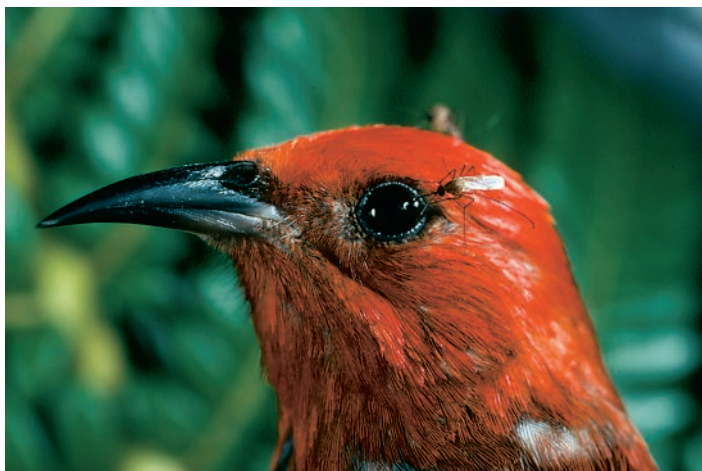
Fig. 3. Culex mosquitoes are the vectors responsible for transmitting avian malaria ( Plasmodium relictum ) and avian pox ( Poxvirus avium ) to endemic Hawaiian forest birds such as the apapane ( Himatione sanguinea ).

We found no unequivocal examples of nat-