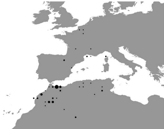
Fig. 1. Recovery sites of pied flycatchers ringed as nestlings or breeding in The Netherlands during spring migration. The size of the dots shows the number of recoveries: 1, 2, 3 and 19 recoveries per 1-degree block.

For The Netherlands we used data collected by the Royal Dutch Meteorological Office in De Bilt, about 50 kilometres west of our study area. The mean daily temperature in the period March 16–April 15 (NL1) was used as local temperature that may affect arrival. For laying date we used the mean daily temperatures in the period April 16–May 15 (NL2) (Both et al. 2004). Correlations between Dutch and African temperatures were: NL1–NL2: r = -0.009 , n = 35 , P = 0.96 ; NL1–North Africa March: r = 0.28 , n = 34 , P = 0.11 ; NL2–North Africa March: r = 0.41 , n = 34 , P = 0.015 ; NL1–North Africa March–April: r = 0.17 , n = 32 , P = 0.36 ; NL2–North Africa March–April: r = 0.33 , n = 32 , P = 0.069 .