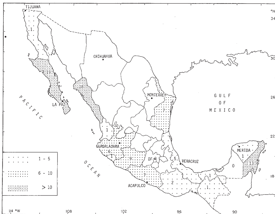
Fig. 1. Number of landfalling hurricanes (all categories) by states in México. 1951-2000 period.