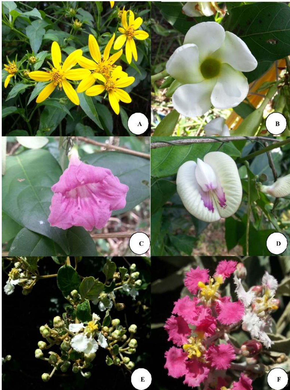
Figure 2. A. Bidens segetum ; B. Odontadenia lutea ; C. Fridericia craterophora ; D. Centrosema sagittatum ; E. Banisteriopsis argyrophylla ; F. Banisteriopsis adenopoda.