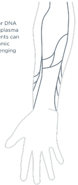
Fig 1. FoundationOne Liquid CDx assay utilization overview. FoundationOne Liquid CDx was designed to allow comprehensive genomic profiling, understanding that shed of tumor DNA can be variable depending on a patient's clinical characteristics.

Variable tumor DNA content in the plasma of cancer patients can make genomic analysis challenging