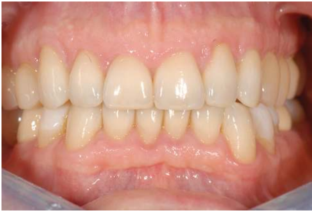
Fig. 3 Final restorations cemented and finished.

complications over the entire observation period 26 and was calculated as the ratio between the number of veneers that did not present complications and the number of total veneers examined. Each complication was considered as a statistical event, cumulative survival was recorded using Kaplan–Meier analysis. All evaluations of potential failures were performed by the same operator at 3-month checks during the observation period, following advices from the literature to detect chipping, fractures, and other causes of failure. 27