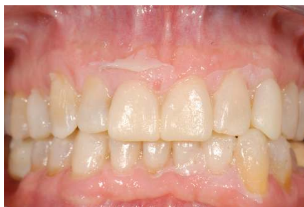
Fig. 2 Mock-up placement.