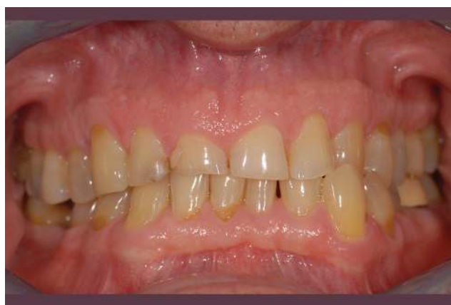
Fig. 1 Patient's conditions at baseline.

►Figs. 1–3 show a representative case of this study. Survival was defined as a restoration being free of all