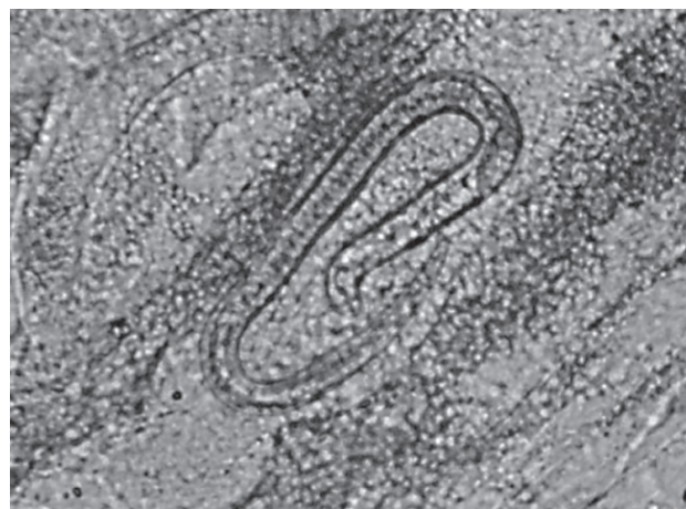
Fig. 1. – Trichinella larvae, detected in one case by trichinelloscopy.

During the acute phase of the outbreak of 474 persons with a history of raw meatball consumption, who were enrolled in this study, trichinellosis was confirmed for 154 (32.5 %), it was highly probable for 71 (15.07 %), probable for 60 (12.6 %), suspected for 42 (8.9 %) and very unlikely for 147 (31.0 %). On the basis of the clinical follow up and serology at six months p.i. , trichinellosis was further confirmed for the 154 cases, because all of them showed a seroconversion (ELISA values > 1.1), whereas all the other patients classified as "highly probable", "probable", "suspected" and "very unlikely" during the acute phase of the outbreak, were considered to be negative (ELISA values < 0.9). One Trichinella larva was detected in one biopsy (this patient with neurologic complications had always eaten raw meats) (Fig. 1). Among the 154 people with a confirmed diagnosis, 87 (56.5 %) were males and 67 (43.5 %) were females.