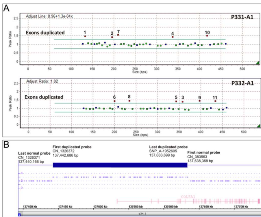
Figure 4 Large genomic duplication in the COL5A1 gene. A) MLPA analysis showed the duplication of exons 1–11 of the COL5A1 gene that was identified using the SALSA MLPA kits P331-A1 (upper panel) and P332-A1 (lower panel). The MLPA results were analyzed using GeneMarker® software. B) Affymetrix Human Mapping GeneChip 6.0 array analysis, which was performed to define the duplication size, revealed an approximately 191 kb duplication, including the COL5A1 proximal promoter region: chr9.hg19:g.(137,440,166_137,442,686)_ (137,633,699_137,638,368)dup. The last normal probe (CN_1326371), the first duplicated probe (CN_1326372) at the 5' end, the last duplicated probe (SNP_A-1952605), and the first normal probe (CN_383563) at the 3' end define the duplicated area.

NMD pathway (Table 2). Specifically, 6 were nonsense mutations and 7 were small genomic deletions/duplications that caused frameshift and the formation of a PTC. Among these mutations, two affected the c.2988 position and were present in three unrelated patients. Patients AN_002514 and AN_002515 (both c.2988del), as well as AN_002516 (c.2988dup), presented a complete phenotype that was compatible with their age (Table 1). Patients AN_002524 and AN_002525, who carried the c.3769C>T transition [p.(Arg1257*)], presented a complete and mild phenotype, respectively, according to their age (Table 1).