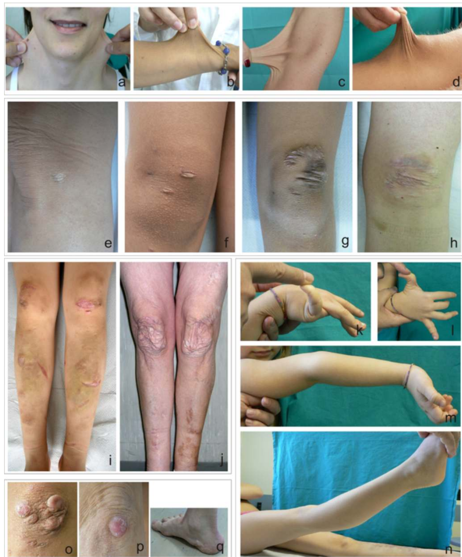
Figure 1 Cutaneous and articular features in patients with cEDS. a-d) marked skin hyperextensibility on the neck, the forearm, the elbow, and the knee; e-h) different scar types, small atrophic, atrophic and hypertrophic, hypertrophic and haemosiderotic; i, j) scars and easy bruising of the knees and pretibial area in a pediatric and an adult patient; k-n) hypermobility of the little finger, the thumb, the elbow and the knee in a pediatric patient; o-p) molluscoid pseudotumors; q) piezogenic papules.

(MRC-Holland, Amsterdam, The Netherlands). The MLPA was performed in duplicate, according to the manufacturer's recommendations ( www.mrc-holland.com ), using 100 ng of gDNA. The P331 and P332 probemixes did not contain probes for exons 12, 33, 36, 49, 54, and 66. MLPA-generated fragments were separated by capillary electrophoresis on an ABI3130XL Genetic Analyzer using 500 LIZ ® as an internal size standard (Life Technologies). The results were analyzed using GeneMarker ® software version 2.2.0 (SoftGenetics, State College, PA, USA). Deletions and duplications of the targeted exons were detected when the height ratios of the fluorescent peaks were lower or higher, respectively, than the normal height ratio range of 0.75-1.30.