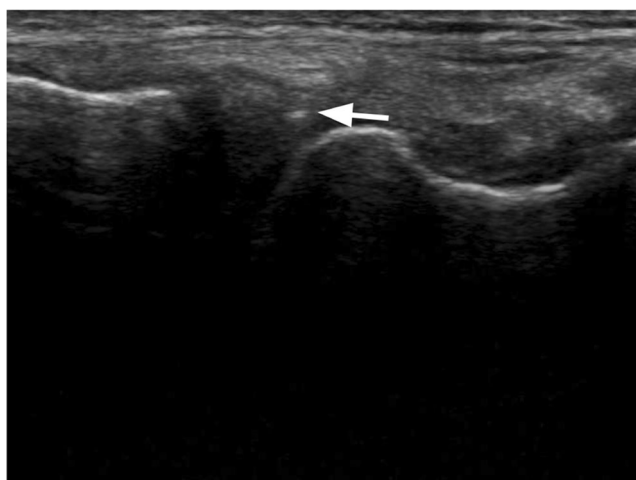
Fig. 3 Needle tip visualized in an out-of-plane view for MFAT injection into the meniscus under ultrasound guidance

This study demonstrated that MFAT injected directly into meniscal tears following trephination of the tear along with a joint injection under direct ultrasound guidance represents a safe and clinically significant treatment option for patients with degenerative meniscus tears and knee osteoarthritis (Fig. 3). Additionally, the study suggests that improvement in knee pain and function scores may be sustained for up to one year. This information can help guide the development of a larger, randomized, controlled trial to determine the efficacy of MFAT. Inclusion of pre- and post-surgical MRI and other