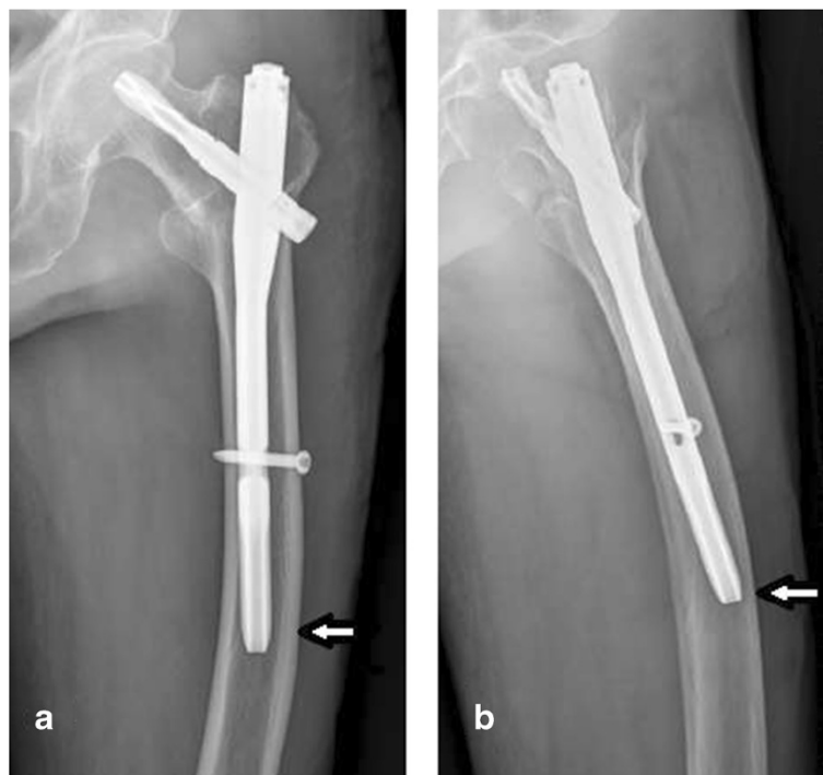
Figure 1 X-ray shows the tip of the PFNA-II against the lateral wall in elderly patients with a larger natural anterior bow of the femur. (a) Anteroposterior view. (b) Axial view.

In conclusion, the PFNA-II has many advantages. First, the operation is simple and the operation time is short. In our clinic, the mean operative time using the PFNA-II was 42.5 min (range, 35–75 min), and major surgical procedures were completed in 30 min. Second, radiation exposure is low; the C-arm fluoroscopy of the PFNA-II was 2.5 times (2–4 times) in this clinical group. The main C-arm fluoroscopy focuses on whether the correct position be placed before inserting the guide pin and whether the location of the guide pin is correct after nail insertion. Third, the incidence of bleeding is low. Compared with the nail–plate system, the PFNA-II only exposes the tip of the greater trochanter, and most patients with osteoporosis do not require proximal reaming; therefore, the incision is small and less bleeding occurs during surgery. The volume of bleeding in our surgical group was only 67.5 mL (range, 42–150 mL).