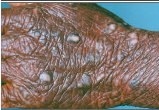
Figure 2. Prurigo Nodules on Lichenified Skin in a Patient with Chronic Pruritus.