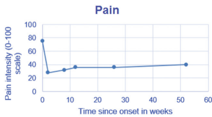
Figure 1. Time course of pain.