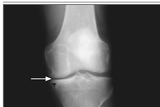
Figure 2. Radiograph Showing Osteoarthritis of the Medial Side of the Knee.

For treating the pain of osteoarthritis of the knee, head-to-head randomized trials showed that nonsteroidal antiinflammatory drugs (NSAIDs) and cyclooxygenase-2 (COX-2) inhibitors are more efficacious than acetaminophen. 19,20 However, the superiority of NSAIDs over acetaminophen (at doses of 4 g per day) is modest. 20 In one large crossover trial, 19 the average reduction in pain during the first treatment period, on a scale of 0 to 100, was 21 in patients treated with NSAIDs and 13 in those given acetaminophen ( P < 0.001 ). Because of the greater toxicity of NSAIDs, acetaminophen should be the first line of therapy. Acetaminophen appears less effective, however, among patients who have already received treatment with NSAIDs; in the crossover trial there was no improvement overall with acetaminophen in patients treated after a six-week course of NSAIDs. 19 Low doses of antiinflammatory medications (e.g., 1200 mg of ibuprofen per day) 21 are less efficacious but better tolerated than high doses (e.g., 2400 mg of ibuprofen per day). 22 One strategy to decrease the potential gastric toxic-