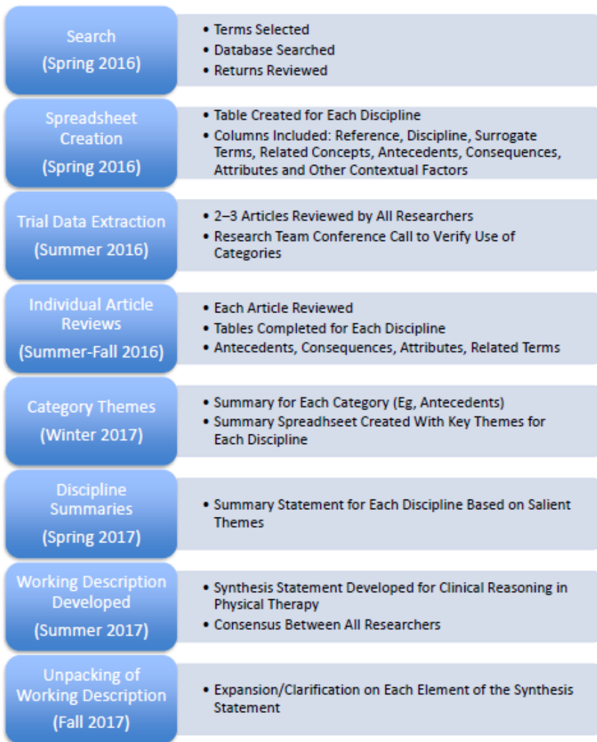
Figure 1: Analysis process timeline