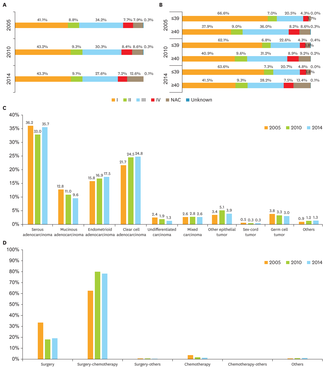
Fig. 4. Characteristics of ovarian malignant tumor. (A) Distribution of post-surgical stages in ovarian malignant tumor. (B) Distribution of post-surgical stages in younger and older patients with ovarian malignant cancer. (C) Distribution of histological types in ovarian malignant cancer. (D) Distribution of treatment methods in ovarian malignant cancer.