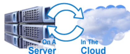
Figure 1. Web based accounting systems location

So, today the web based accounting software is internet-based technology where the information is stored on the server or in the cloud (Figure 1). The cloud based accounting system is basically a way to run business accounts entirely online and provided as a service (Software as a Service) on-demand to clients (from the "clouds" indeed) It is also known as online accounting, or in some circumstances SaaS (software as a service) accounting software. Its impact will be on both consumers and firms. On one side, consumers will be able to access all of their accounting data from any device like the personal laptop or the mobile phone (Nesbit, 2009; Walsh, 2011). On the other side, firms will be able to rent the software from a service provider and to pay on demand.