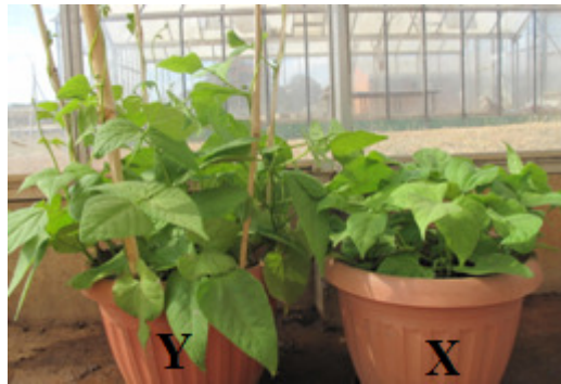
Figure 2. Differences in morphology between Parental genotype (Sakala) X (determinant) with its mutant (SK 44-33-1) Y (Indeterminant).