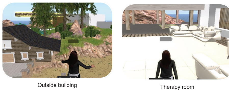
FIGURE 1 Images of the initial design of the island

programmable features in Second Life, such as avatars portraying vampires and zombies, or the ability to fall and fly: