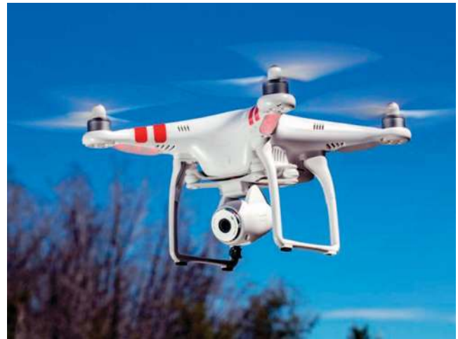
Figure 2. DJI Phantom 2 Vision Quadcopter with integrated camera.

Unmanned helicopters come in many different configurations. One popular, stable design is the quadcopter, a multi-rotor helicopter that is lifted and propelled by four rotors. Quadcopters use two sets of identical fixed-pitch propellers: two rotating clockwise and two counterclockwise. Control of