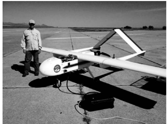
Figure 1. The Sensor Integrated Environmental Remote Research Aircraft (SIERRA) on the tarmac at NASA's Crows Landing Airport in California.

These SUAVs have advanced designs to carry small payloads and integrated flight control systems, giving them semiautonomous or fully autonomous flight capabilities. In autonomous UAVs, the acquisition of remote-sensing data is preprogrammed with flight planning software that can calculate waypoints for image acquisition based on the desired ground resolution, amount of image overlap, and area to be surveyed. Digital cameras are commonly part of the payload. During the flight, the UAV's autopilot can communicate via a telemetry link to a ground station running flight control software (Hugenholtz, 2012). For example, the AeroVironment RQ-14A "Dragon Eye" has a 110-cm wingspan and weighs about 2.5 kg. Launched by hand or with a bungee cord, the small plane is controlled by GPS coordinates entered into its guidance system with a standard laptop computer. Once aloft, it can transmit video images of the coastal landscape in real time (Edwards, 2009).