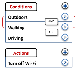
Figure 2: Mockup of the end user interface to specify “condition-action” tasks.

Tasks are represented as JavaScript programs. The CITA interpreter provides a way for JavaScript to deal with Java objects and call methods on them [7]. CITA exposes phone devices as objects — a developer can simply call methods on the object to manipulate it. This object model is convenient because it enables a developer to work with multiple phones in a single script. When a script creates multi-device tasks, CITA partitions the task into sub-tasks, and executes and coordinates sub-tasks across the devices.