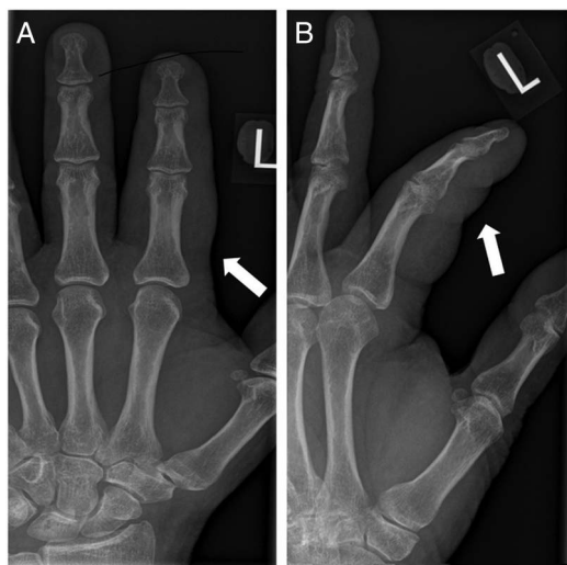
Figure 1 Left hand radiograph: (A) posterior-anterior and (B) oblique views. White arrows indicate significant digital soft tissue swelling of the left index finger. Note there is no evidence of erosive disease or features of osteomyelitis.