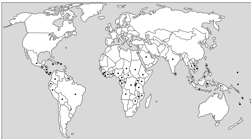
Fig. 1. Countries with known records of Hypothenemus hampei . Note: dots do not indicate the precise location where the pest was initially recorded or its present area of distribution within the respective countries.