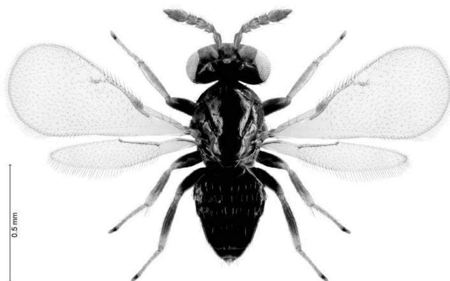
Fig. 3. Female Phymastichus coffea .