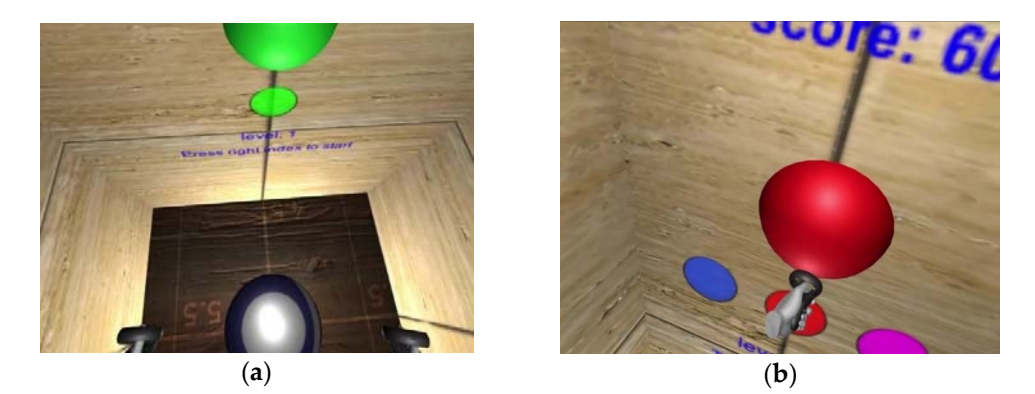
Figure 2. Virtual reality exposure therapy for claustrophobia with an added CR task. ( a ) Before the start of the gamified attention task; ( b ) during the gamified attention task.