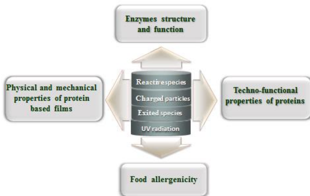
Fig. 1 Research areas in the manipulation of proteins in food systems with cold atmospheric plasma