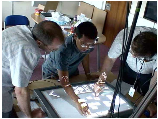
Figure 1. The study setup and DiamondTouch surface. Left: a group working in the mouse condition. Right: A group working together in the touch condition

told what they had to do in the task. The experiment concluded with a debriefing session.