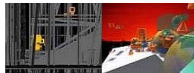
Figure 4: Primitives can symbolize both positive and negative representations of design-elements, remaining interpretable by viewers of the model (HeliPad, VeDS108, Phase 3; Playground, VeDS112)