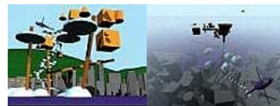
Figure 3: Primitives representing functions or forms, independently of their actual 3D shape (HeliPad, VeDS110, Phase 3 - 4)