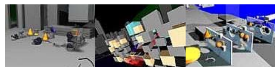
Figure 7: Differences in design- and operation-skills as well as architectural language can also be observed (HeliPad, VeD106)