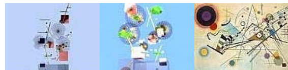
Figure 6: Plan and perspective of a design with an image by Kandinsky as mental inspiration - image added later by student (Playground, VeDS106).