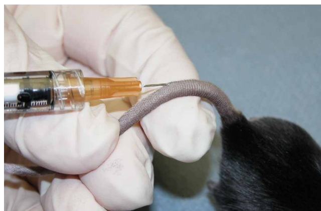
Figure 1 | Proper technique for immunization of mice for the induction of CIA. Emulsified CII in CFA is injected i.d. in the skin of the tail at approximately 1.5 cm distal to the base of the tail.

14| Although animals do not need to be anesthetized for immunization, it is significantly easier to inject the emulsion in the proper tissue layer while the mice are under anesthesia (isoflurane), and many IACUCs require this. Choose an injection site about 1.5 cm distal from the base of the tail, being careful to choose a tissue site and not a vessel. If a booster immunization will be given at a later time point (see Step 15), be sure to leave sufficient space above the immunization site for the booster injection. Slowly inject a 50 µl volume intradermally (i.d.) into the tail (Fig. 1). There will be noticeable tissue resistance to the injection. A rapid, easy injection can be indicative of a subcutaneous or deep tissue injection and can result in a poor incidence of disease.