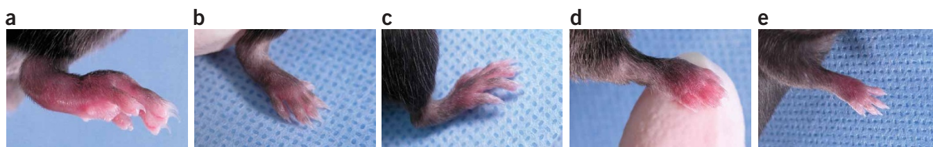
Figure 3 | Arthritic hindlimbs and forelimbs in mice immunized with CII emulsified in CFA. (a–c) Arthritic hindlimbs with severity scores of 4 (a), 3 (b) and 2 (c). Pictures clearly demonstrate how the inflammation progresses up the limb as the severity of the arthritis increases. (d, e) Arthritic forelimbs with severity scores of 4 (d) and 3 (e).