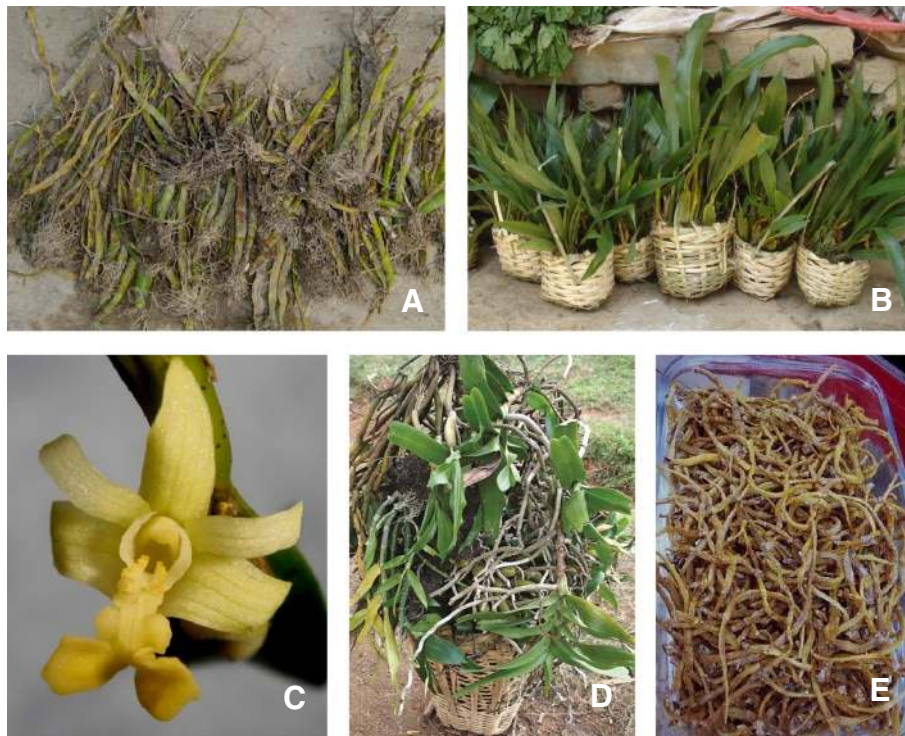
Figure 2 Trade in illegally collected medicinal orchids in Nepal. 2A. Dendrobium eriiflorum (photograph: B. Kunwar). 2B. Coelogyne species in market outlets (photograph: A. Subedi). 2C. Flickingeria fugax (photograph: A. Subedi). 2D. Aerides and Dendrobium species in traditional bamboo baskets (photograph: B.B. Raskoti). 2E. Dendrobium eriiflorum originating from Nepal in Hong Kong supermarkets (photograph: Anonymous).

Dakshinkali, 22 km from Kathmandu, is the center of wild orchid trade in Nepal, and orchids have been sold for over 25 years. Dakshinkali has at least 10 vendors that are