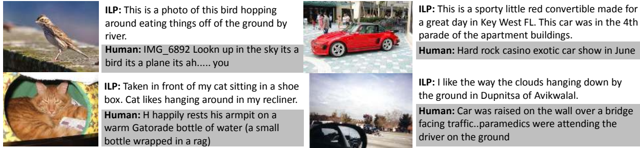
Figure 2: In some cases (16%), ILP generated captions were preferred over human written ones!

the objective function (Eq. 12). Via F_{sijpq} , we aim to quantify the degree of syntactic and semantic cohesion across two phrases x_{sij} and x_{spq} . Note that we subtract this cohesion score from the objective function. This trick helps the ILP solver to generate sentences with varying number of phrases, rather than always selecting the maximum number of phrases allowed.