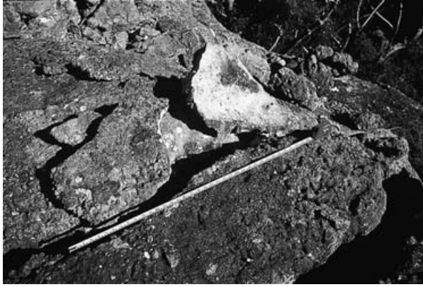
Plate 2 Human disturbance to rocks on our study sites was clearly visible from the physical displacement or breakage of rocks.