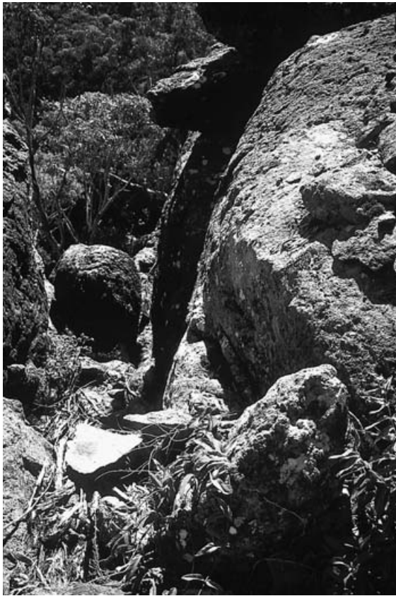
Plate 3 A scar on the rock substratum where an exposed rock has been pushed over the cliff. The displaced rock is clearly visible in the lower left hand corner of the photograph.

were no visible signs that natural rocks on our study sites had been disturbed. However, in August 1995 some 'artificial rocks' (concrete paving slabs) on the study sites had been overturned and several shading