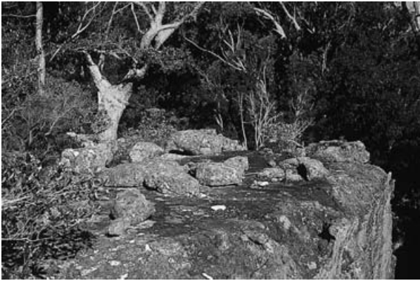
Plate 1 Sandstone cliffs on our study sites in Morton National Park. During winter and spring, broad-headed snakes and small-eyed snakes use small exposed rocks near the cliffs as thermoregulatory sites. Rocks in the adjacent forest are heavily shaded by vegetation and are unsuitable for thermoregulatory sites, and are seldom used by snakes in our study populations (Webb & Shine, 1998b).

and determined sex by manual eversion of hemipenes and from tail shape (females of both species have narrow, tapering tails). At each site we estimated the percentage of rocks that had obviously been recently disturbed by humans (indicated by the remains of crushed invertebrates underneath rocks, overturned rocks, or rocks not placed back in their original position). We replaced all the rocks that had been moved back to their original position (flush with the underlying rock substratum).