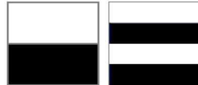
Figure (2): Images having same color proportions but, different spatial distribution [12].

shown in figure 2 have the same color proportions but different spatial distribution. Correlation histogram (correlogram) tries to fix this histogram's drawback by taking the spatial correlation of color distribution into account, and shows how the spatial correlation between pairs of colors is changing with distance [13].