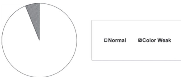
Fig. 1. Distribution of color weak persons among the population

With increasing experience doctors tend to make more use of intuition when making decisions, while medical students are more likely to use analysis. 16 Students are therefore at a stage when they would be relatively open to advice about their congenital color vision deficiency and its effects on their work. Screening enables the student and later the doctor to become aware of limitations in their powers of observation and devise ways of overcoming them; as a result confidence may be gained and anxiety avoided; an informed choice of career can be made; the patient is protected from harm