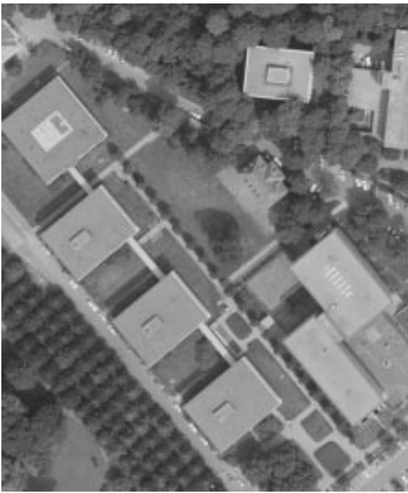
Figure 3: Aerial image