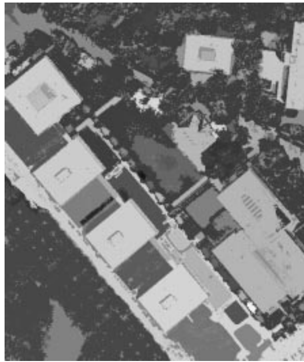
Figure 4: Segmentation result

formula, the computational effort depends only from the size of the model and is independent from the size of the segmented region.