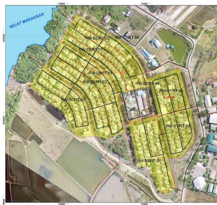
Figure 2. Map of Untia Coastal Slum Area

The population of Untia is 378 households or 1,922 people, consist of 1,013 men and 909 women, with a population density of 231 people per ha. The demographic composition based on ethnicity consists of the Makassar (93.34%), the Bugis (5.93%), the Betawi (0.06%), the Javanese (0.26%), the Ambon (0.26%) and the Flores (0.15%).