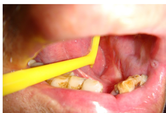
Figure 4 Submandibular gland flap for reconstruction of gingival cancer. Three months postoperatively, submandibular gland is essentially the same color as the oral mucosa.

To date there has been no consensus about preservation of the submandibular gland during neck dissection in oral cavity and oropharyngeal cancers. Traditional surgical treatment includes excision of the submandibular gland and the surrounding lymphatic tissue in addition to removal of the primary lesion. Submandibular glands are frequently excised as part of neck dissection. With the development of functional surgery, an increasing number of investigations have demonstrated that cancer metastasis to the submandibular gland is quite rare and that it is feasible and oncologically safe to preserve the submandibular gland with no involvement of cancer metastases during neck dissection followed by close postoperative follow-up. Whether to preserve the submandibular gland depends on the following conditions: (1)