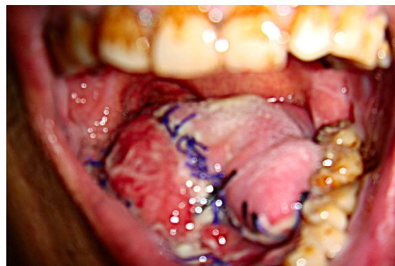
Figure 3 Submandibular gland flap for reconstruction of tongue cancer. One week postoperatively, surface mucosalization of the submandibular gland is bright red.

Postoperative follow-up began at the completion of treatment and ended 31 May 2013. No patient was lost to