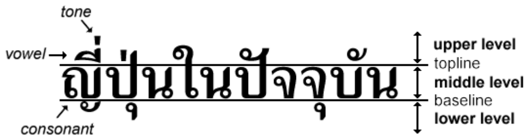
Figure 1. No explicit word delimiter in Thai

which each word is separated from the others by white spaces, this task is comparatively simple. If the tokenized string is not found in the dictionary, it could be an error string or an unknown word. However, for the languages that have no explicit word boundary such as Chinese, Japanese and Thai, this task is much more complicated. Even without errors from OCR, it is difficult to determine word boundary in these languages. The situation gets worse when noises are introduced in the text. The existing approach for correcting the spelling error in the languages that have no word boundary assumes that all substrings in input sentence are error strings, and then tries to correct them [9]. This is computationally expensive since a large portion of the input sentence is correct. The other characteristic of Thai writing system is that we have many levels for placing Thai characters and several characters can occupy more than one level. These characters are easily connected to other characters in the upper or lower level. These connected characters cause difficulties in the process of character segmentation which then cause errors in Thai OCR.