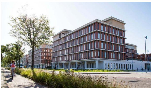
Figure 1. The exterior of the hospital.

The hospital building studied was completed in March 2015 and in use since August 2015 (Figure 1). The building comprised of outpatient and treatment areas and inpatient wards (480 beds). A combination of single bedrooms and shared bedrooms was realized at the inpatient wards on the upper three floor levels of the building. Both types of patient rooms had all sorts of orientation: north, east, south, and west.