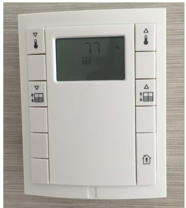
Figure 3. Thermostat and control blinds.