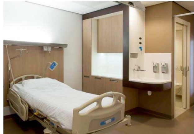
Figure 2. Single bedroom.

bedrooms, the bathroom was accessible from the corridor. Control of temperature, access sunlight and general lighting was possible on building and on room level (Figure 3). In each bedroom, the occupants could decrease or increase the temperature with 2 °C. Blinds between the glass blades provided sun protection. The occupants could lower or raise the blinds, according to their needs. The blinds were available on the east, west and south facades.